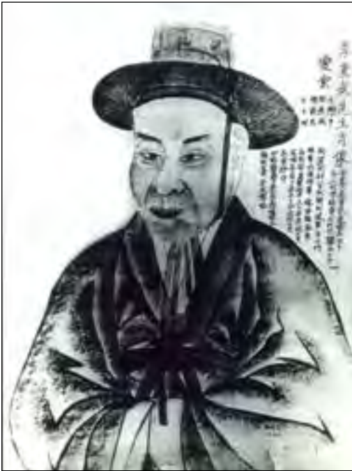
Portrait of Lee Je-Ma

philosophy, and Lee's Sasang philosophy was built as an alternative to Neo-Confucianism, which lost influence, resulting in confusion in 19th century Joseon society. Although its way of perception is Confucianism, it is a different method of philosophy. While traditional Chinese medicine has the basic theory of Zangxiang and the meridian system based on yin-yang and five elements, SCM defines Sasang types— taeyang , taeum , soyang , and soeum —and explains physiology, pathology, treatment, and nurturing life (養生), grounded on Sasang philosophy. In SCM, every person is applicable to one of the four Sasang types. Since there are differences in appearance, mind, and symptom depending on constitutions, SCM has different approach to physiology, pathology, treatment, and preventive management for each person of different constitution.