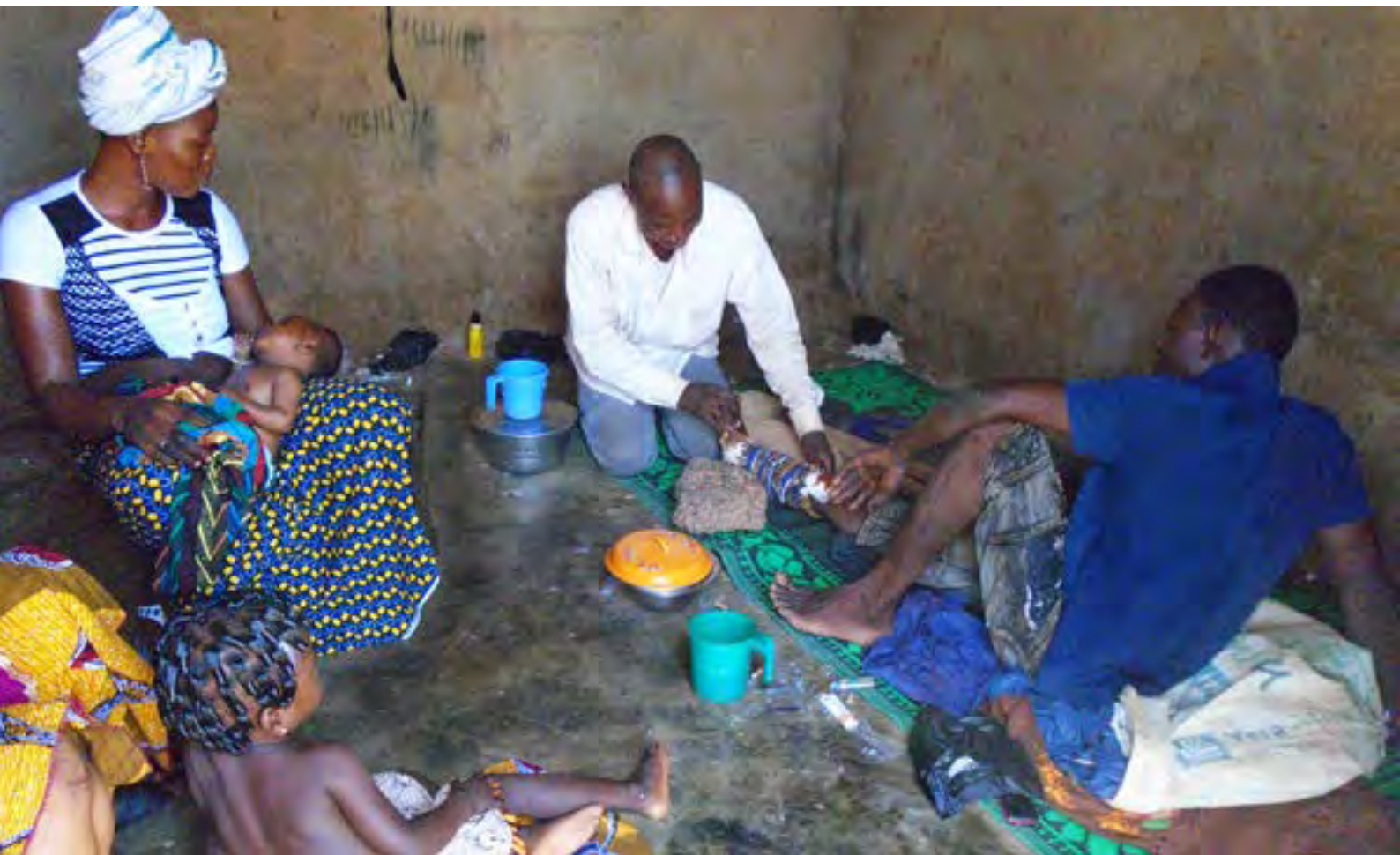
Séance de pansement