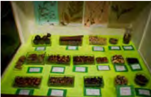
Collection of dried berries and minerals used in making traditional medicine

People, who understand the need for a right lifestyle, do not excessively consume meat and fat. They restrict desires and emotions and