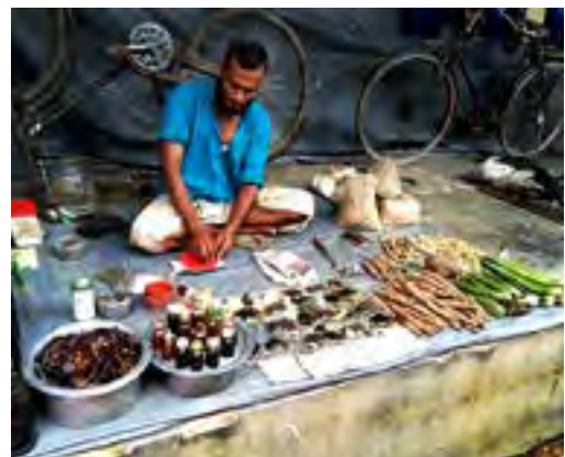
A Muslim kaviraj displays his medicines and herbs while preparing in the local market of North Bengal, a poorer part of the country