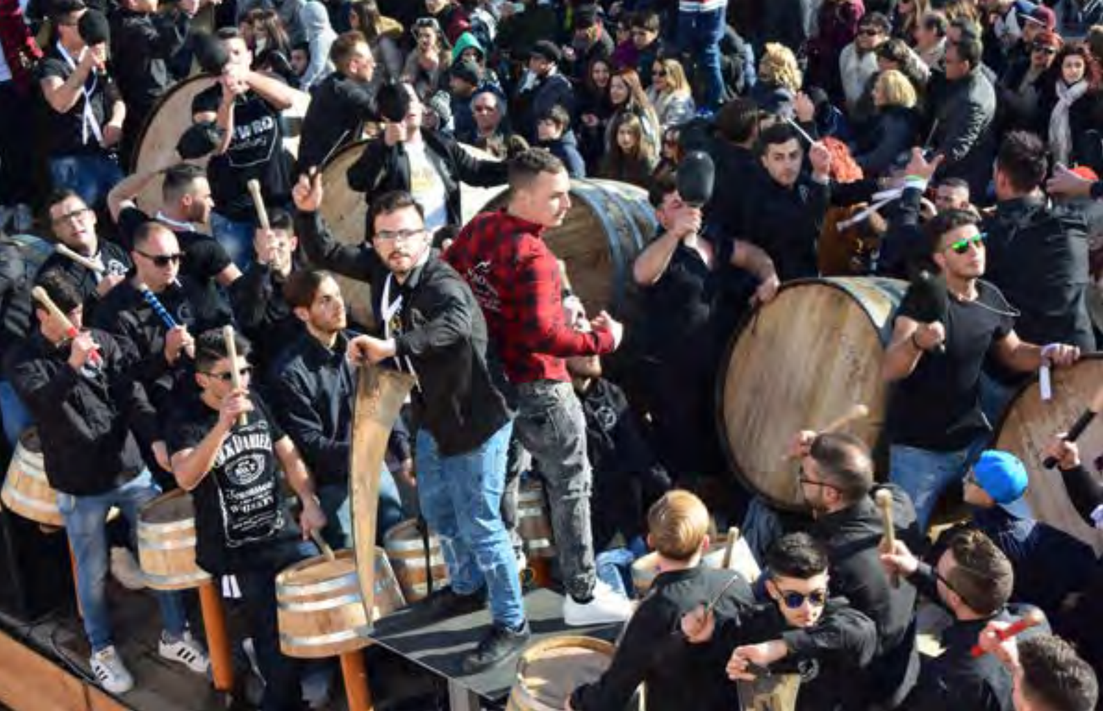
The bottari (“barrel-beaters”) of Macerata Campania.