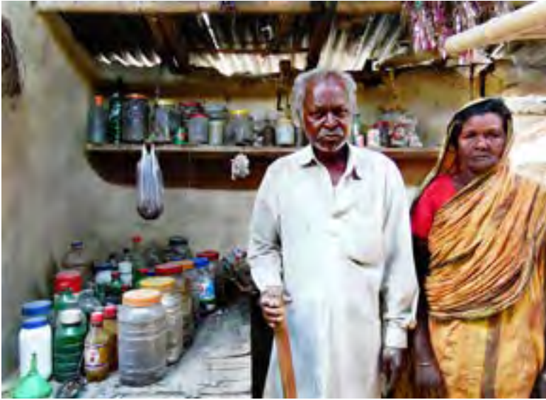
This couple is from the Santal ethnic community of North Bengal. Based in their home in the Chapainabganj District, they have been practicing kaviraji treatments for 40 years

dose, administration time and mixture played a significant role in need of combinations of useful extracts by the traditional practitioners. In some cases, carrier materials show a significant function. The preparation of medicine by kavirajes is mostly based on leaves. Plant parts which are used for preparing medicines include barks, bulb, cord, fruit, flower, leaf, root, rhizome, seed, seed pulp, seed oil, stem fruits, and whole plants. Kavirajes rely almost exclusively on medicinal herbs in their formulations, which are simple and mainly consist of plant juice administered orally, or rubbed on the body parts as paste/cream or in other topical forms depending on the ailment. The proportion of the use of different parts of the plants, however, was observed in one study as leaf 35%, fruits 22.20%, roots, seeds 13.30% each; stem 11.10% and whole plant 8.90% (See,