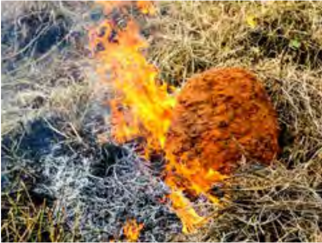
Making fire with beanstalk, the pot is covered with red clay