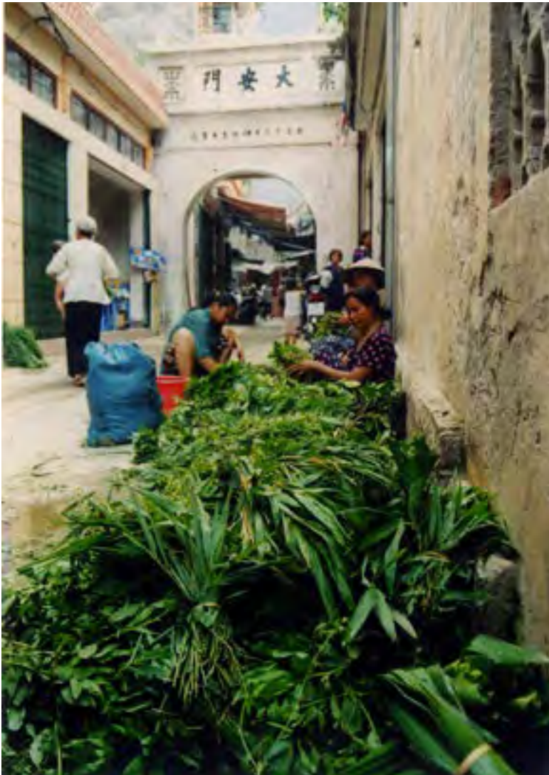
Porte des Feuilles avec des herbes à vendre

Les jardins familiaux de simples (herbes aromatiques, médicinales, plantes utiles) contribuent également aux pratiques des herboristes. Cette culture se développe au sein du village, dans les parcelles des enclos