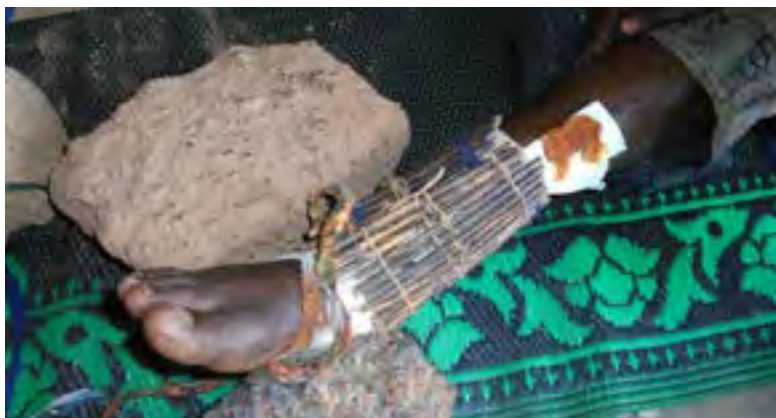
Pied avec atèle

Dans la nomenclature des domaines du Patrimoine Culturel Immatériel (PCI) au Burkina Faso, qui du reste se confond avec celle de l'Unesco, le reboutement est classé dans le domaine des Connaissances et pratiques concernant la nature et l'univers et dans la catégorie de la médecine et la pharmacopée traditionnelles. Comment est-il mise en œuvre ?