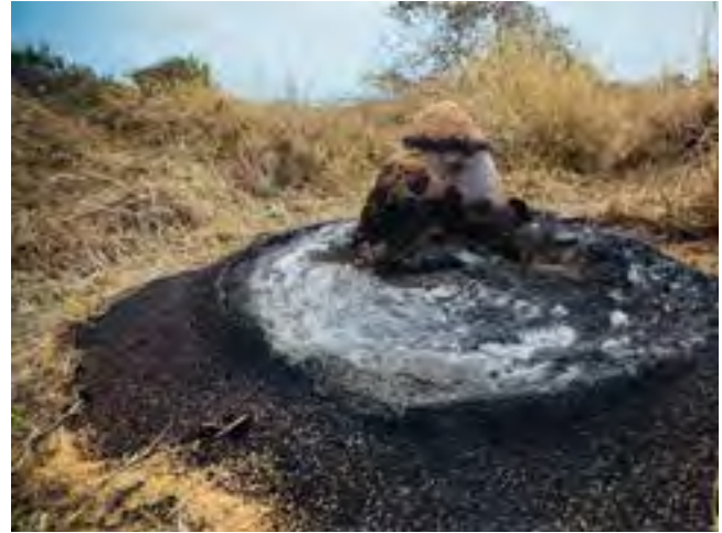
With the fire extinguished, the red clay is removed