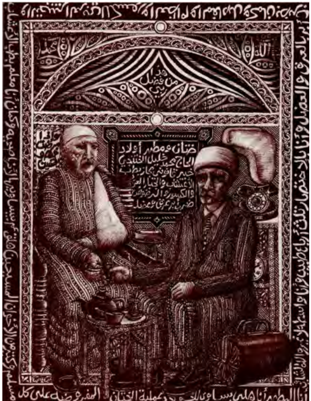
An illustration of a traditional circumcision practitioner, from Old Stores and Merchants by Syrian artist Khaldoun Shishakli, courtesy of Dar Al Bashaer

Today, traditional medicine is practised by all Syrian communities, where traditions and beliefs vary among different governorates and areas. There are literally hundreds of traditional healing methods still practiced in Syria today. These include: traditional exorcisms through