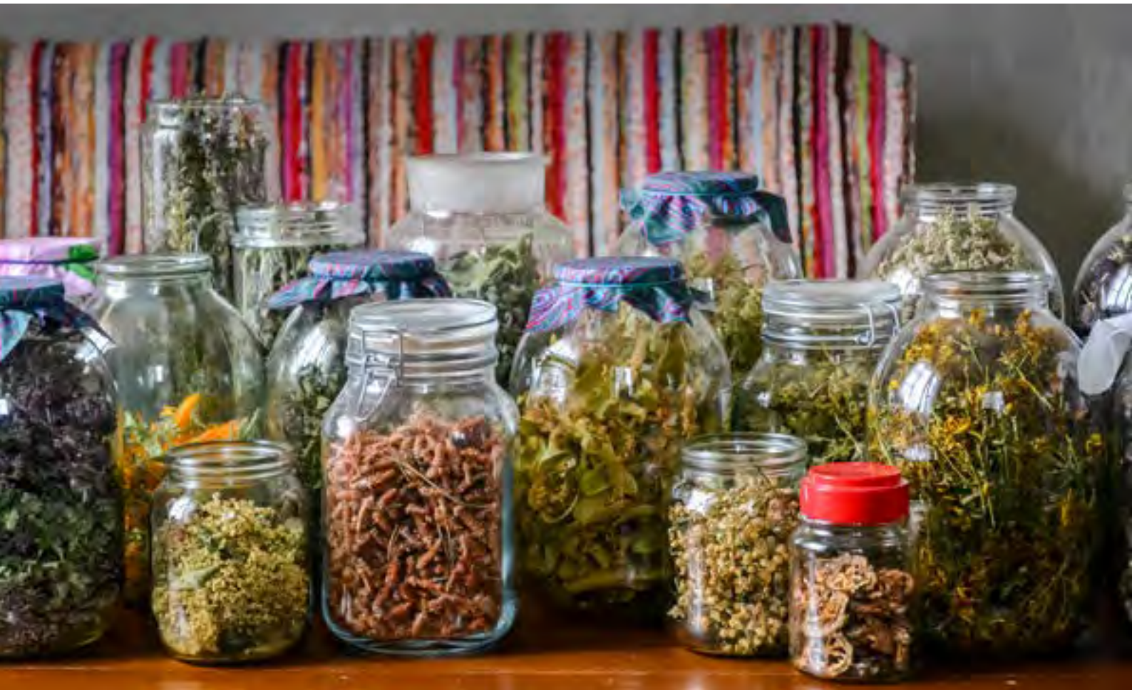
Winter stocks, Aizpute, Latvia, 2010

At the same time, working also within contemporary art and technology processes, SERDE, together with artists and cultural workers, offers educational introductions and workshops (on how to boil soap, make candles, brew beer, forage for medical plants etc.) to reinvigorate local knowledge and traditional skills. Internationally SERDE's projects and performances that are strongly connected with Latvian