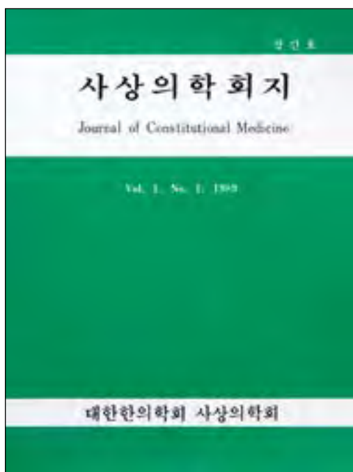
First volume of the Journal of Constitutional Medicine, published in 1989.

Succession. Saam acupuncture is influenced by Heo Jun's Dongui-Bogam and Heo Im's Chimgu-Kyunghumbang . Its original manuscript has been handed down and is available in Korean translation of Saamdoin-Chimguyokyul (國文譯註 舍岩道人鍼灸要訣), Saam-Chimgujeongjeon (舍巖鍼灸