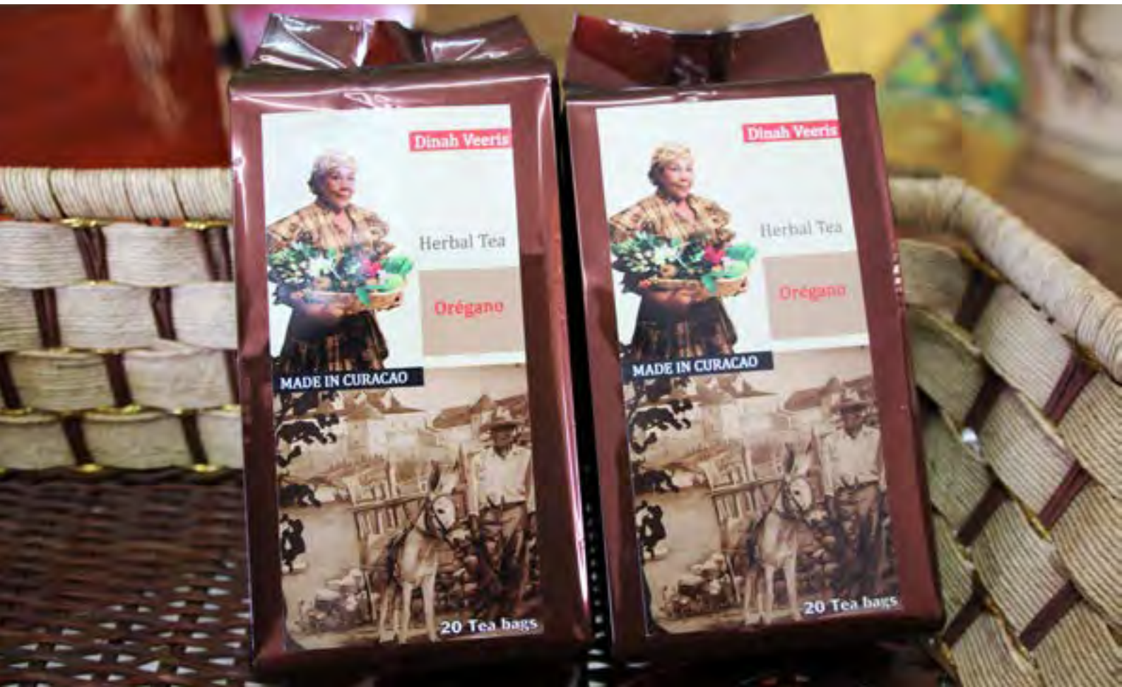
Modern packaging for traditional herbs at a local herbalist shop.

As a small island, Curaçao has maintained a connection to indigenous traditions through various means, including imports by itinerant vendors (even including instances of Columbian/Venezuelan Wayúu, Chilean Mapuche, and other South American indigenous vendors),