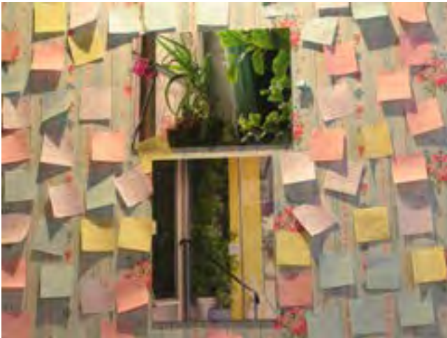
Visitors' recipes at a folk pharmacy exhibition, Riga, 2010