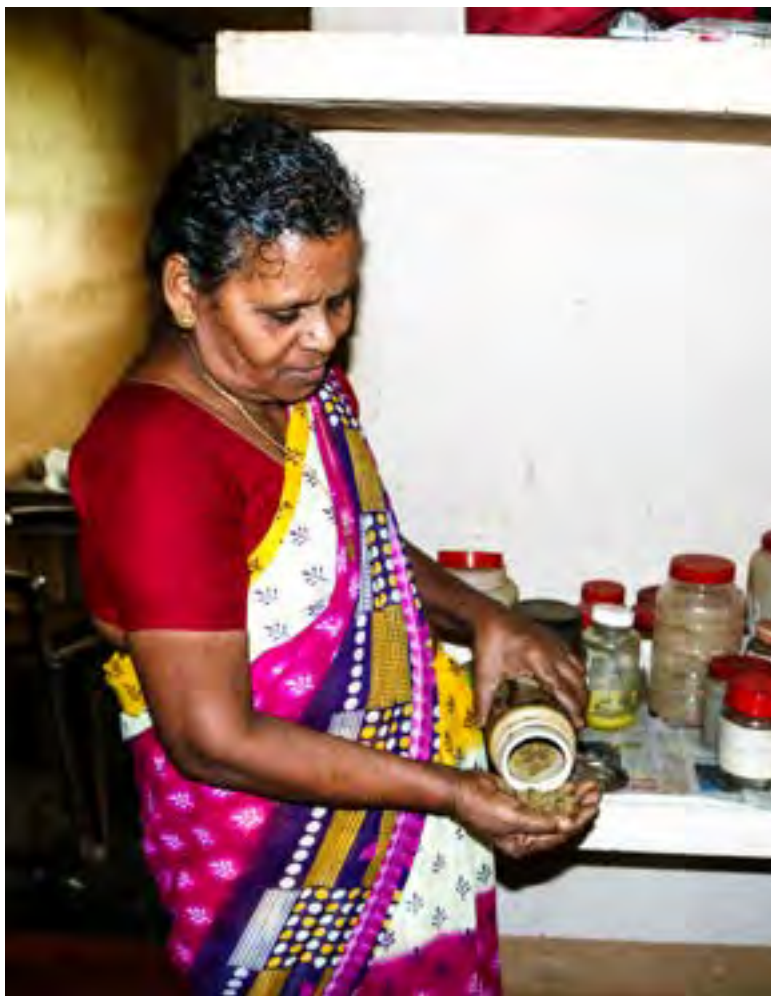
Preparing indigenous medicine

tradition that has its origin in the Greek Ionian medicine. Rasashastra is a healing method that uses medicines made of metals, especially mercury and gold, after purifying them using complex procedures and techniques. It believes that Rasa formulations when combined with yogic and tantric practices give extraordinary powers, such as arresting the process of ageing. The Siddha tradition is a healing method prevalent in South India, especially in the Tamil speaking region and continues to be popular there. It combines elements of Ayurveda, Rasashastra, Yoga and Tantra and uses metals prepared through complex procedures along with medicinal plants. The Siddha system had its origin from the influence of Chinese and Arab medicine. The Sa-Rigpa tradition practiced in Tibet and Himalayan regions is a combination of Ayurveda, derived from Vagbhata's Ashtanghrdayam , and folk practices along with a strong influence of Tibetan Buddhism.