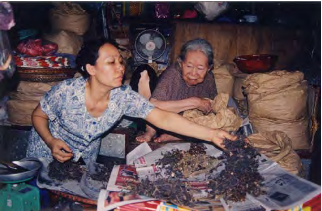
Herboriste âgée et sa fille dans son échoppe installée à un marché de Hanoi