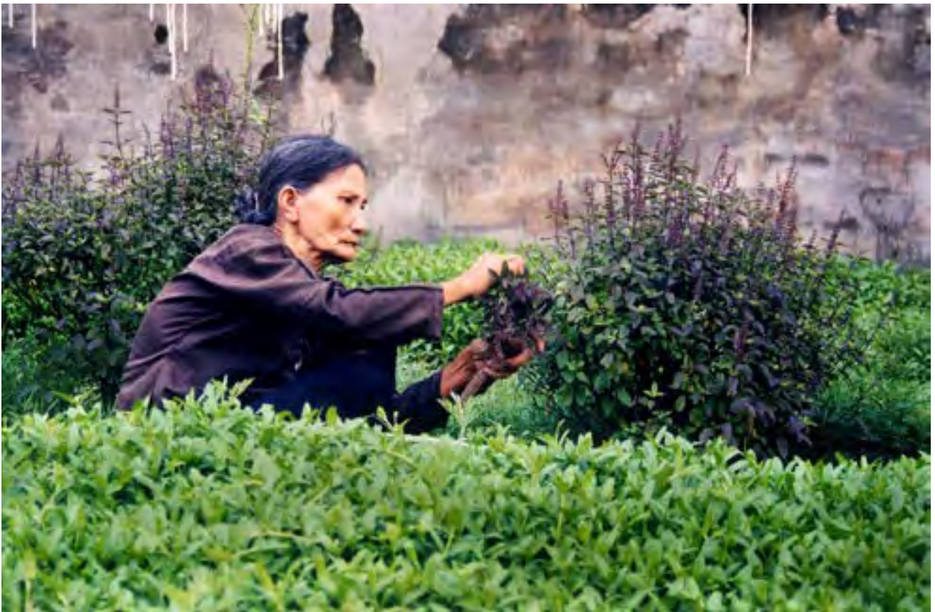
Femme récoltant le basilic sacré ( Ocimum sanctum )

La vente des herbes et des ingrédients botaniques utilisés par les herboristes se fait au marché quotidien du village. Celui-ci est appelé «le Marché des Feuilles», car il est destiné au commerce des ingrédients frais, la plupart constitués d'herbes et de feuilles vertes. Le marché se tient tous les après-midis jusque bien tard le soir, devant l'ancienne porte