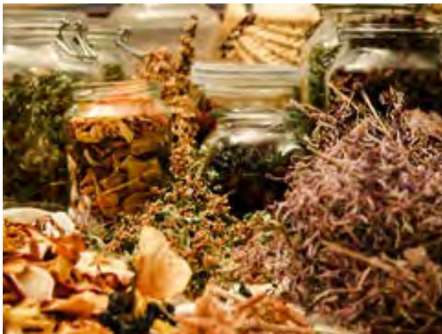
Dried herbs at a folk pharmacy, Aizpute, Latvia, 2010