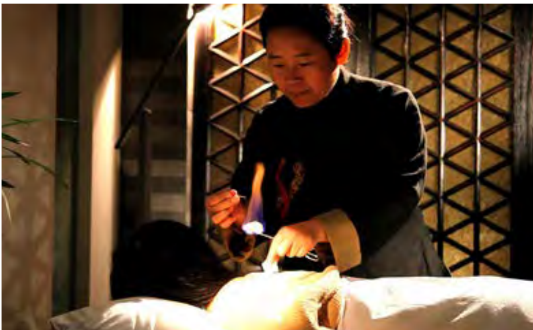
Disciple of He Puren, representative successor, demonstrating the fire needling technique (photograph Wang Kai) : © Institute of Acupuncture and Moxibustion, with the permission of UNESCO

Example 3. The third element is about the traditional knowledge of the jaguar shamans of Yuruparí in Colombia, inscribed in 2011 on the Representative List of the Intangible Cultural Heritage of Humanity.