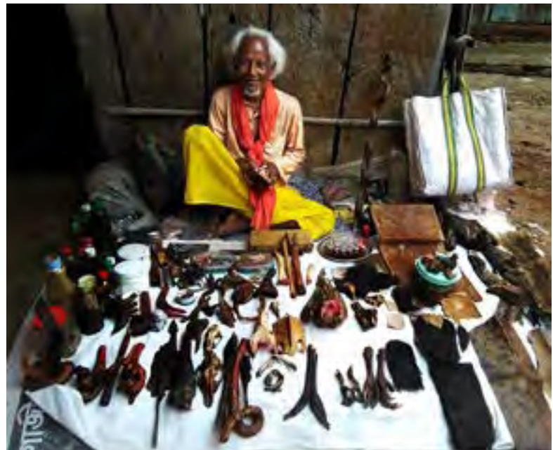
An old kaviraj in a rural market in Tanore, Rajshahi, displaying his tools, raw materials, and medicines to attract clients © Santosh