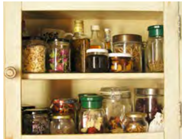
Traditional medicine shelf in the Latvian countryside, 2010

generation knew many things about the plants and roots surrounding them in the countryside. However, with the mass shift of families away from rural settings to city and urban locations, this knowledge is being lost, slipping away from the younger generation, at a time when information and media sharing online is booming.