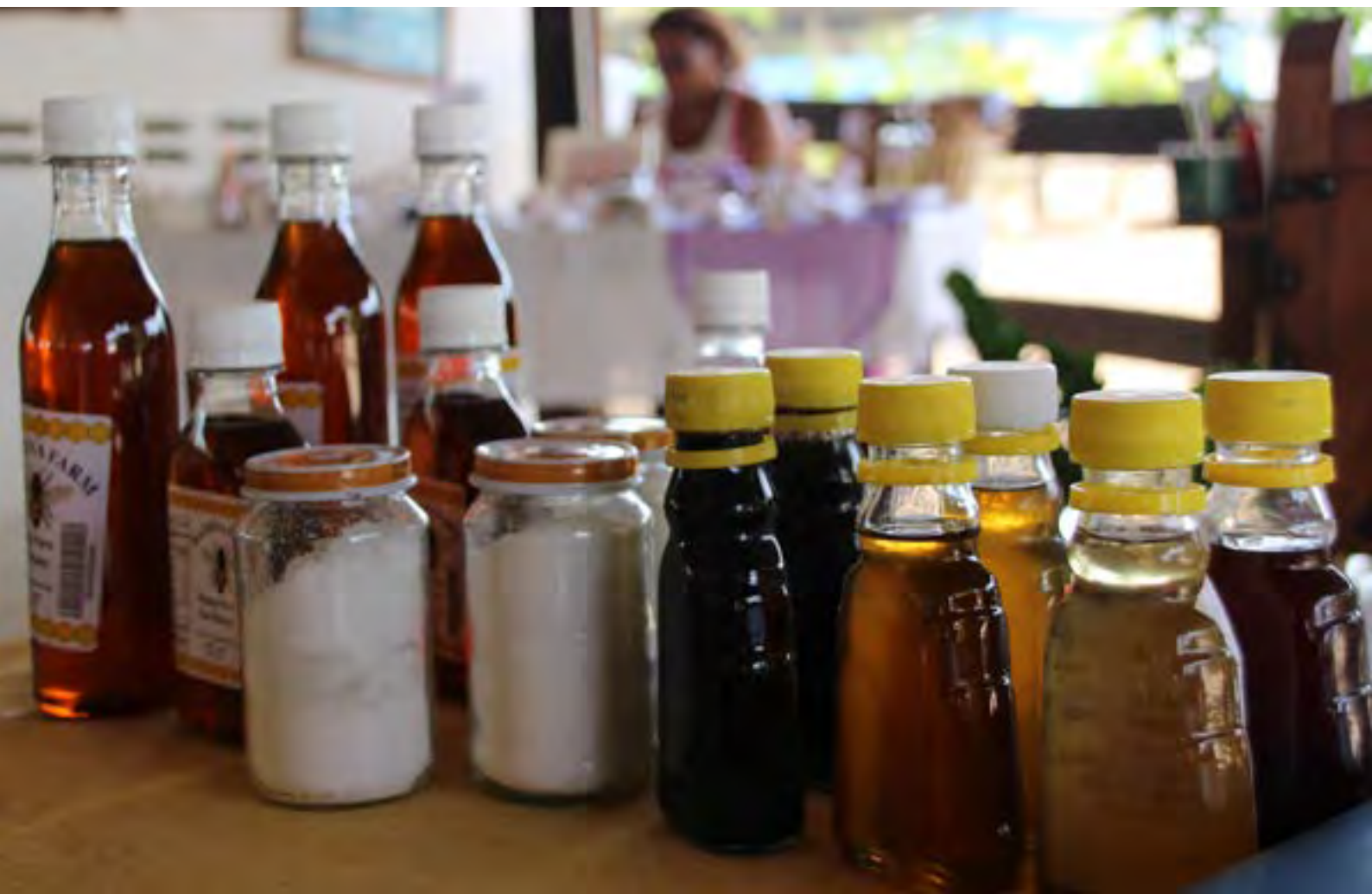
Recycling and medicinal products at a bo salú ta den bo kurá gathering on herbs.

Most of the current safeguarding efforts for traditional medicine occur outside of the implementation efforts of the 2003 Convention. Curaçao started moving toward implementation of the Convention in 2010. In 2012, The Kingdom of the Netherlands ratified the Convention and Curaçao, a constituent country within the kingdom, co-ratified in 2016. As part of the process of implementation Curaçao established a Steering Committee of several community representatives, including the NGO that was most identified with promoting herbalism at that point, Den Paradera. COSs, NGOs and networks of healers, have been instrumental in making traditional medicine more visible in the past