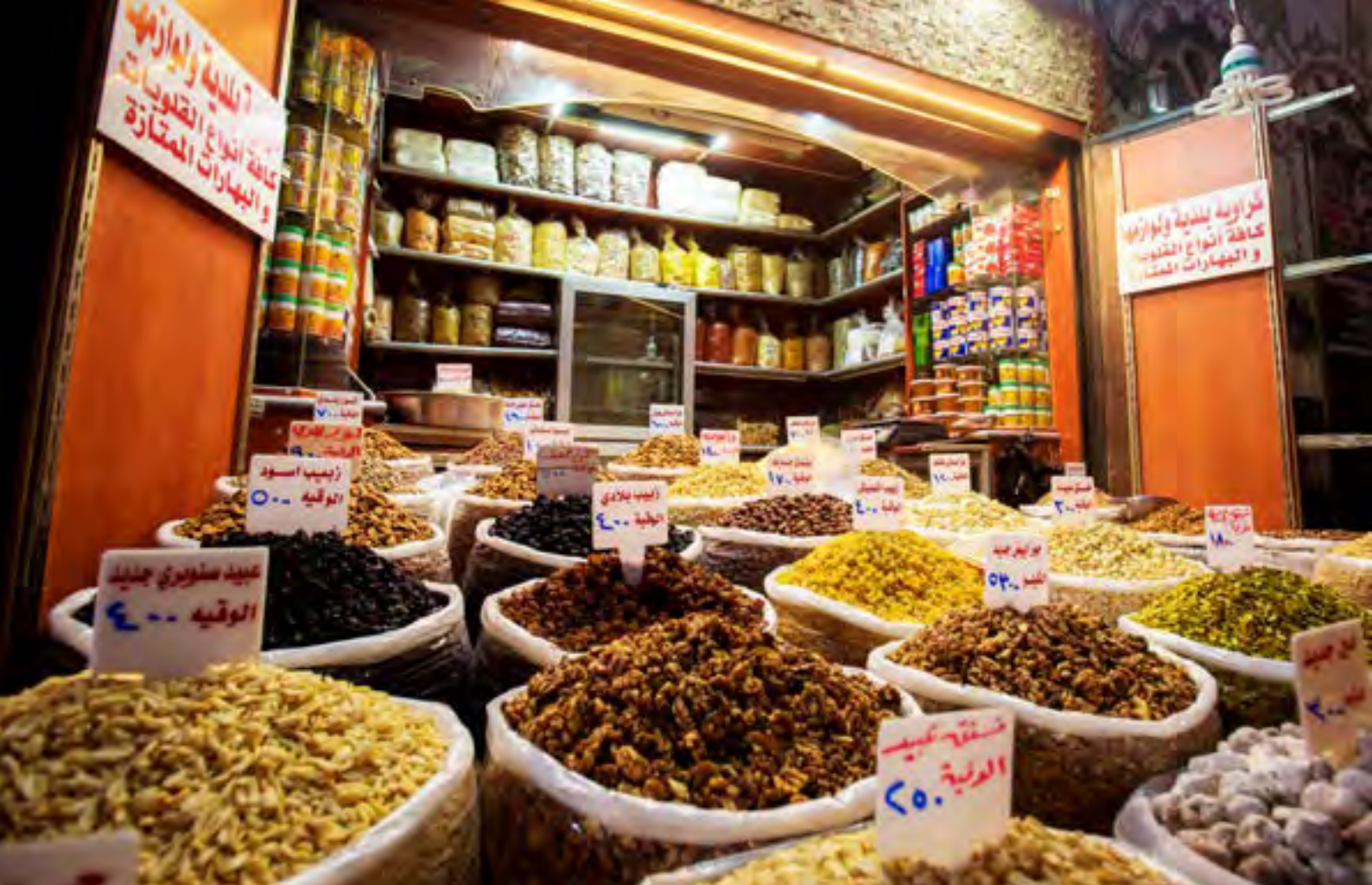
Apothecary store in the Bzourieh souk in Old Damascus

that cupping therapy helped in reducing blood pressure, controlling blood sugar, raising the numbers of red blood cells, and enhancing white blood cells and platelets.