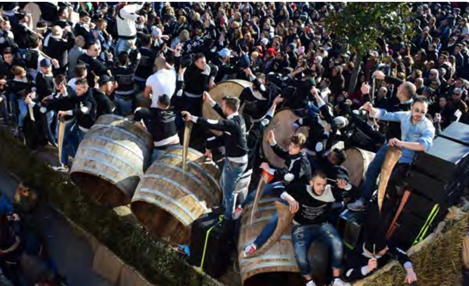
Moments of the feast of St. Anthony the Abbot—Macerata Campania, Italy, 17 January

The most recurring rhythm performed by the bottari is called a Sant'Antuono and involves the use of barrels, vats and sickles. Usually, this rhythm starts and ends with a continuous note called ruglio or