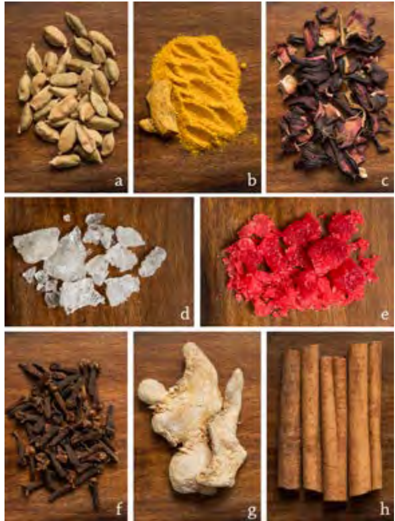
Some Spices for making Lohusa Sherbet. (a) cardamom, (b) turmeric, (c) hibiscus, (d) nöbet şekeri , a crystallized sugar thought to have medicinal properties, (e) measles sugar, (f) clove, (g) ginger, (h) cinnamon