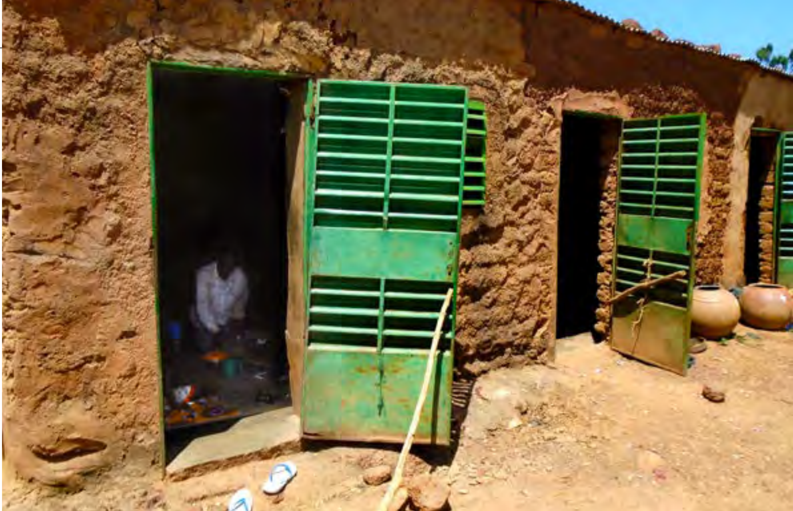
Maison de pansement

lésions traumatiques (immobilisation par plâtre, repositionnement des os par chirurgie, radiographie pour mieux comprendre le traumatisme, anesthésie pour circonscrire la douleur, etc.), la médecine moderne a du mal à supplanter le reboutement, pour ce qui est du traitement des entorses, foulures et même de fractures de membres. Quelles en sont les raisons ?