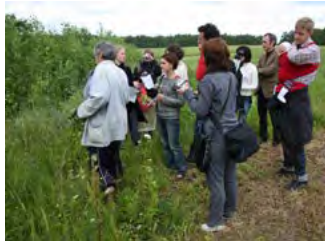
International Herbologies-Foraging Exhibition, Riga, 2010

not effective. Many of those interviewed mentioned Soviet-era experience—'doctors could not help or there was no medication at all'. Unique, but very popular for this area is medical use of mushrooms, such as stink horn ( Phallaceae ) "which you can drink to treat cancer" (C.S.) and amanitas ( Amanita muscaria ) "for muscles, for legs or when I have something wrong with veins" (C.S.).