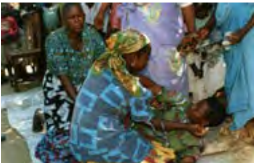
Healing ritual connected to the Vimbuza Healing Dance

Vimbuza is a therapeutic healing which deals with mental illness. It is based on music, singing and dancing in combination. The virtues of the healing are believed to expand the body and help cure soul and mind. This therapy belongs to a larger category which can be found in a variety of cultures and societies such as the Haitian vodou 6 or the Moroccan gnawas . 7 The “trance” generated through singing dance and music, is the main characteristic of this kind of practice. In addition, the dance has an artistic dimension since drumming and singing are an important part of it. A rich repertoire of songs, music and dancing are a significant part of the ritual.