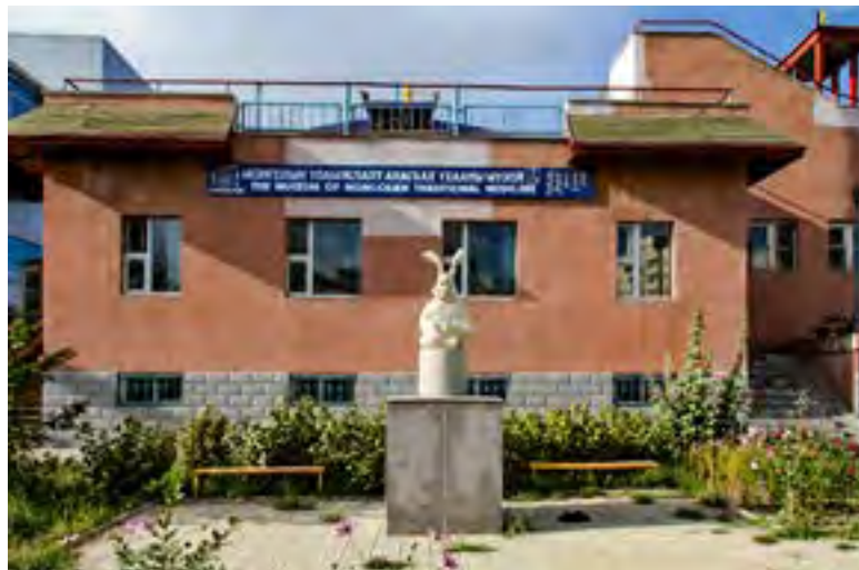
Exterior of the Museum of Mongolian Traditional Medicine, with a statue of a rabbit, the symbol of traditional Mongolian medicine

To keep drinking water clear, Mongolians did not prohibit animals from grazing around the source of any river, nor did they throw any garbage, food, or drink into water. Our ancestors treated water with great respect calling it chindamani (wishing jewel) and taught their children not to pollute any water areas. There was a tradition of not spoiling